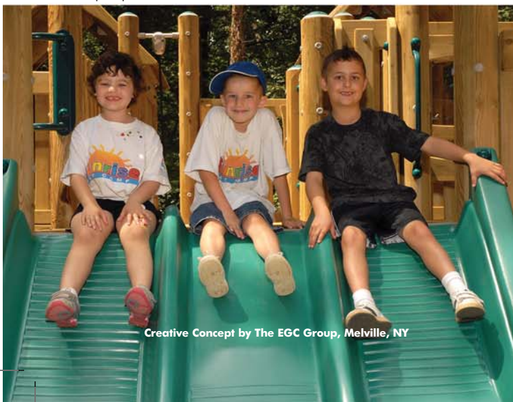
Creative Concept by The EGC Group, Melville, NY

Please join us by participating in our Golf & Tennis Classic and helping Sunrise Day Camp give children with cancer a place where they can experience all the fun, joy and friendship that a summer camp experience can deliver. Your efforts will make a difference.